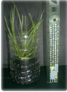
Fig. 3 Acclimatization of plantlet in husk charcoal media