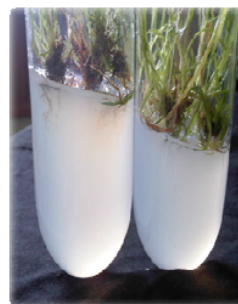
Fig. 2 Root induction in the in vitro shoots of java vetiver

Almost all (90%) of plantlets were survived during acclimatization in husk charcoal media (Fig. 3). Husk charcoal is suitable for plant acclimatization media, because it can absorb and maintain water availability in the media, inhibit the growth of pathogenic organisms, show good aeration and drainage and fix toxic substance [21].