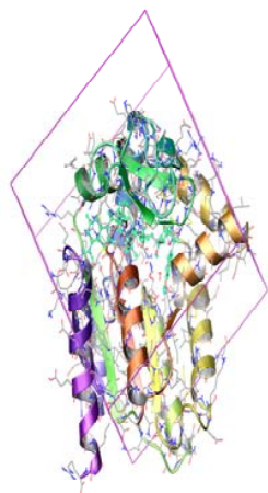
Fig. 1 3D structure of IZIP

The receptor protein was downloaded from Protein Data Bank [PDB] and refined using protein wizard of Schrodinger suit 2012. A typical structure file from the PDB is not suitable for immediate use in molecular modeling calculations. The tools of Schrodinger suite 2012 is used for the purpose [12] – [13]. The refining process involves fixing structures first, then deleting unwanted chains and waters, then fixing or deleting het groups, and finally performing some optimization of the fixed structure.