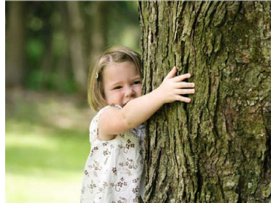
(a) Input image