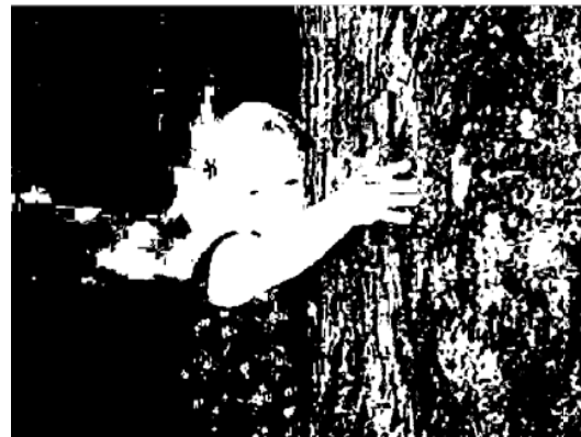
(b) Skin colour segmentation