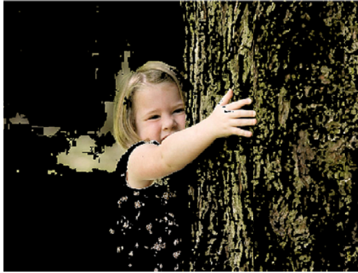
(b) Result after sharpening