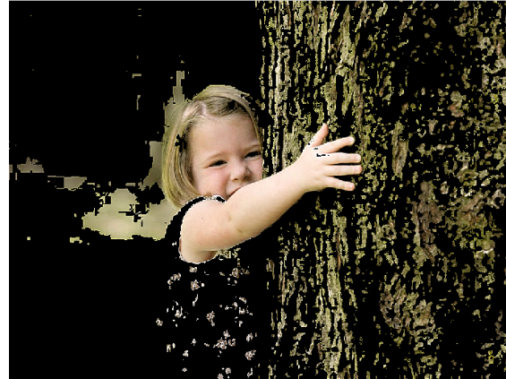
(a) Image with false skin regions

Fig. 5 shows the final image result on the sharpening skin image after texture application.