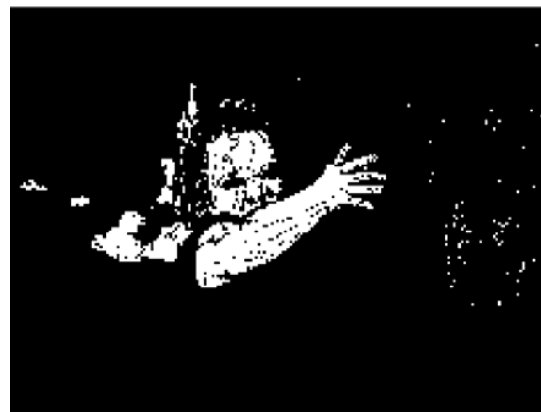
(b) False regions reduced using GLCM