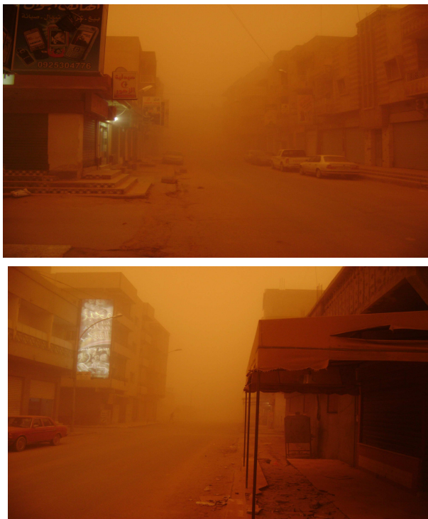
Fig. 2 Frequent dust and sand storms in Benghazi city, Libya in 2009

The deposition of seeds into the soil and the compaction of soil due to its non-permeability to rainwater may lead to the lack of growth [20]. These results are similar to those of previous studies ([11]; [13]; [17]; [18]). C-Loty found that free and unregulated grazing leads to soil erosion and low production capacity and does not benefit from water. In addition, rainfall increases the runoff speed, reduces soil permeability to water, and accelerates the process of evaporation. Walks and the presence of animals also hardened the soil, reduced the permeability to rainfall, and increased the runoff at the shelf surface layer, thereby causing a lack of plant growth of plants (run over) [7].