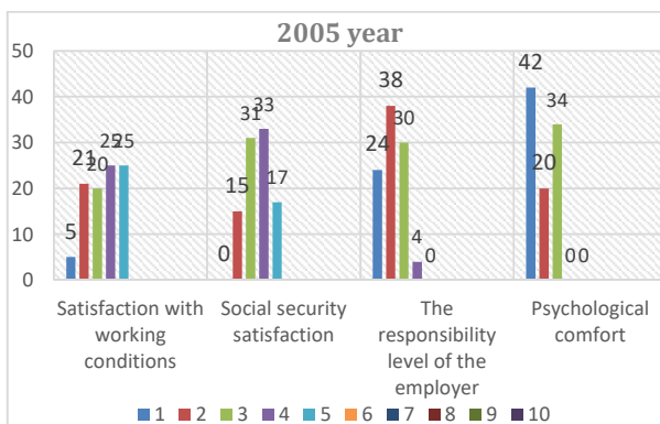
Fig. 1 Employee satisfaction according to 2005 data

Results of the survey are graphically reflected as follows: