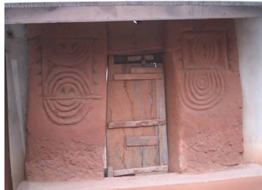
Fig. 5 Uli design on mud wall