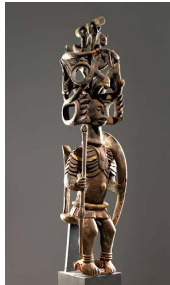
Fig. 1 Ikenga with surface designs