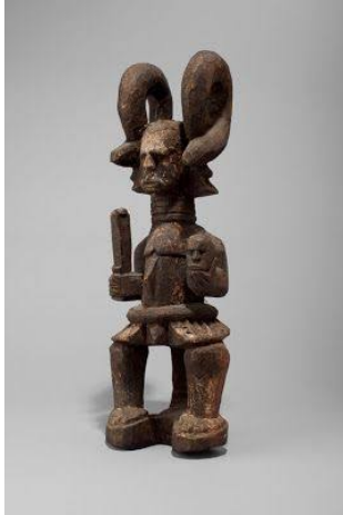
Fig. 2 Small-sized Ikenga without surface decorations