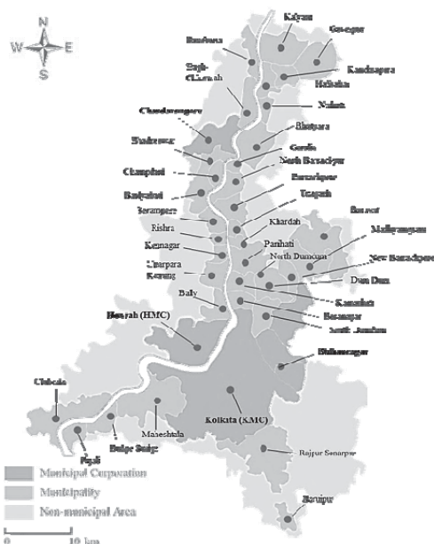
Fig. 3 Kolkata Metropolitan Area (KMA)

In Table III, the above-mentioned factors have been identified from a pool of factors, selected from extensive literature review. From ordinal logit regression [30], 'T' value for every selected factors have been calculated, and the 'T' value of those factors which have satisfied the value at 95% of confidence level (in this case it is 1.684) have considered as the most important factors to evaluate livability potential. At a conclusion, the above-mentioned factors (Table III) are the prime factors through which livability potential can be measured within a metropolitan scale.