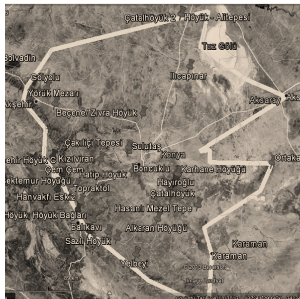
Fig. 2 Neolithic settlement in the region Lykaonia

After briefly summarizing the prehistorical ages of the region, to mention the classical age history;