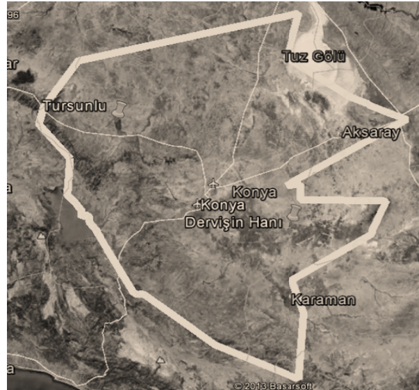
Fig. 1 Paleolithic settlements in the region Lykaonia