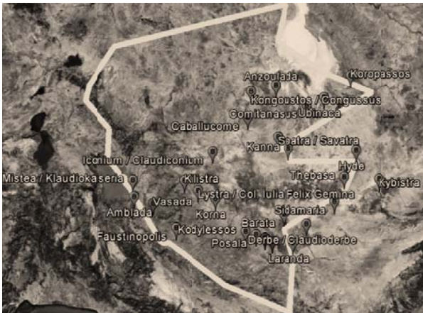
Fig. 4 Classical Period Settlement Region in Lykaonia

Vasada (Ousada): It is on the antique road 65 km southwest of Bostandere - Konya. In Ptolemaios, it is referred as Hellenistic City. It sent representatives to 451, Chalcedon consul [26]. There are ruins of a theatre with the capacity of 1000 audiences [3] (Fig. 4).