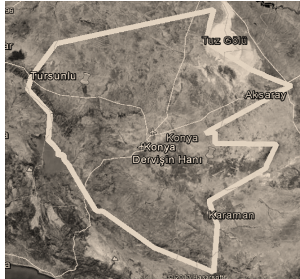
Fig. 1 Paleolithic settlements in the region Lykaonia