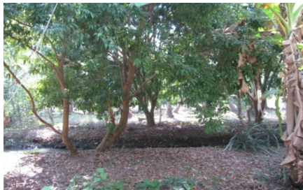
Fig. 2 The lychee orchard