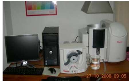
Fig. 5 Atomic Absorption Spectrophotometer Instrument (THERMO series) [9]

60 Sediments sample were collected from 60 orchards. These samples were carried by polythene bag. After collection, some portion of sediment samples was dried in air at 30°C. For heavy metal test, 5 gm of dried sample was digested with nitric acid and prepared 100 ml solution. Finally, four heavy metals (Pb, Cd, Cu, and Zn) concentration were determined by atomic absorption spectrophotometer (AAS), (Fig. 5).