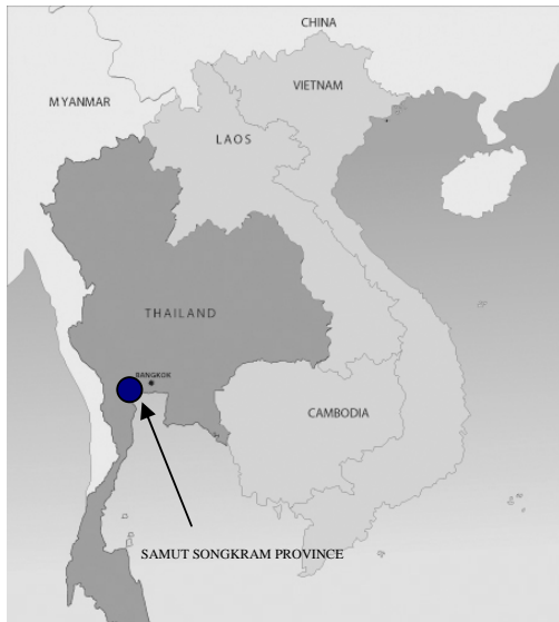
Fig. 1 Map of Thailand [1]