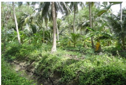
Fig. 4 The coconut orchard