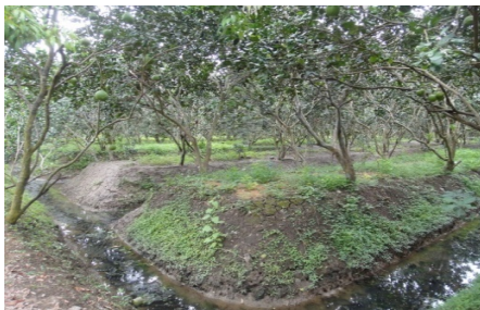
Fig. 3 The pomelo orchard