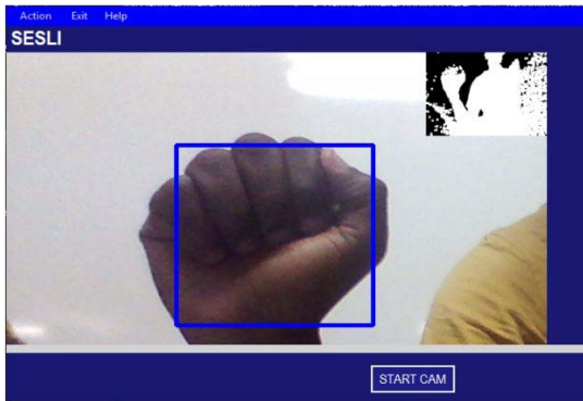
Fig. 3 Closed palm hand detection

Fig. 3 depicts the system being used to detect a closed palm using the Canny pruning Haar detector algorithm. The system uses the algorithm depicted in Fig. 2. The system tracks the hand's location. Upon finding the position of the hand, the system extracts the area of interest through a feature extraction done by the Canny pruning, which utilizes the Canny edge detection algorithm. Thereafter, the system creates a convex hull of the region highlighted with a blue square. The region highlighted as the convex hull is then cropped after being detected. Thus, the area of interest is cropped and stored as an image in a folder generated by the HaarCascade file written in xml. The hand detection algorithm is dependent on the distance of the user from the camera.