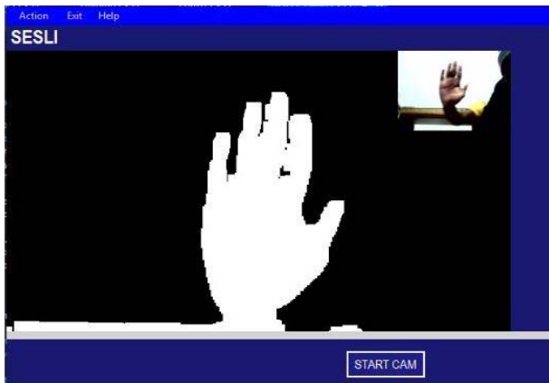
Fig. 5 Skin detection

Fig. 5 depicts a skin detected image from a detected hand.