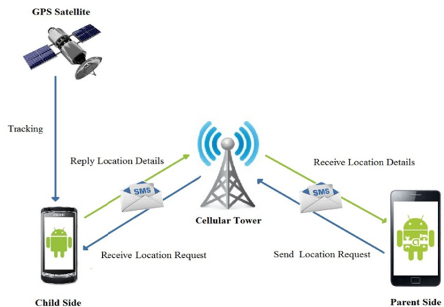
Fig. 1 Architecture of the Proposed System

We propose a solution to solve the problem based mainly on GPS and GSM technologies. It takes advantage of the two main rich features that is offered in advanced smart mobile platforms nowadays. Those features are location services, mainly GPS, and basic telephony services, mainly SMS. The solution proposed will be implemented to support Android platforms in a later work. The system proposed is based on a simple idea that is the use of SMS for communicating between the parties involved, parent and child. It is designed in a simple way so that it will involve few elements and less user interaction. This way it will result in a system that is simple and easy to implement and use, making it more user-friendly.