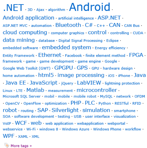
Fig. 1 Original tag cloud of most popular tags

The originally applied font distribution algorithm uses weights based on number of classes, average, maximum, minimum reference counts, and tags are classified to four classes.