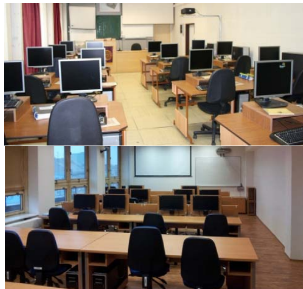
Fig. 2 Other specialized work place for testing Flexible Communication Platform

The task originates from the need to define the activities in the frame of emergency management. It comprises the reconstitution of affected/damaged communication area into a stabilized level, like the ensuring of basic functions in given area, i.e. properties serving for communication, for data exchange, for interoperability etc. The problem will also comprise not only how to stabilize the area but the creation of conditions for further development of communication security area [13]. The test Specialized Classroom (Fig. 1) is connected to other specialized workplaces, among which a testing and exchange of information and data. These are shown in Fig. 2.