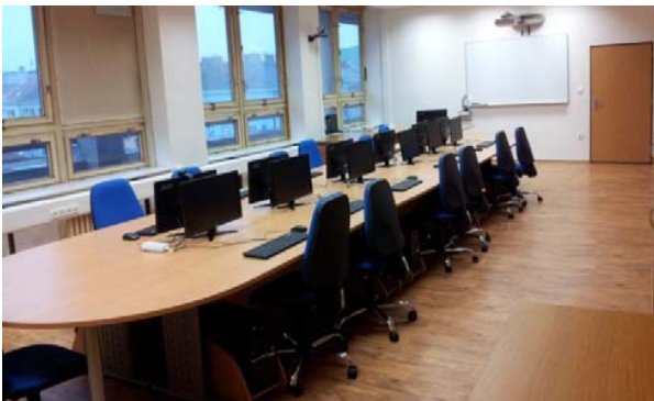
Fig. 1 Specialized Classroom for testing Flexible Communication Platform

There are many research institutes dealing with science and research in communication technologies. They toy with the question of the use of common security technologies and other security options that use the principle of COTS (Commercial Off The Shelf) [1] as much as possible. That means the maximal utilization of commercial products and services to create a specific system or technology [9], [13]. An example is the testing workplace. That is implemented with minor changes in specialized classrooms of Department of Civil protection. This can be seen in Fig. 1.