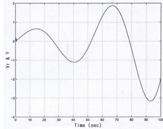
Fig. 1 The trajectories of the reference and the output

In this case, \gamma_{min} = 1.08 which is much larger than (CASE I). But we can still guarantee the performance bound of the system with uncertain initial condition. The performance of (CASE II) is depicted in the Fig. 2.