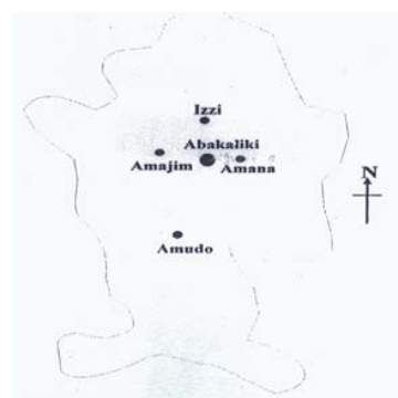
Fig. 1 Map of Ebonyi State showing the sampling locations

Edible mushroom samples were detected by throwing them to fowls and if taken implies that they were edible. The edible mushroom samples were collected from their staple (the primary food materials of which the mushroom was grown). These consisted of dead wood, grassland and gardens from four different locations in the suburb of Abakaliki and one rural area of the State. Random sampling method was adopted for this work [10]. In this method, six different mushroom kinds from the same species were selected and used for analysis.