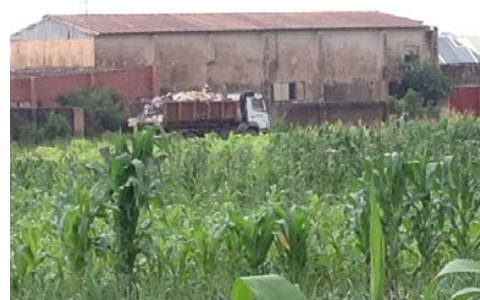
Fig. 2 (b) Truck load of urban refuse being delivered to farmers