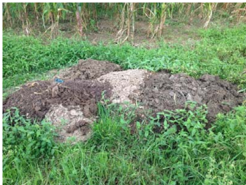
Fig. 3 (e) Dried sludge to be used for soil amendment