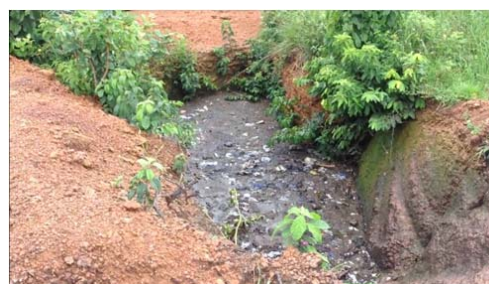
Fig. 3 (b) Household sewage sludge disposal pit