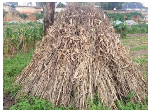
Fig. 2 (a) Maize haylage to be incorporated into ash production

identified from a long-term experimentation.