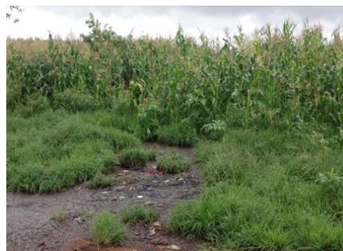
Fig. 3 (a) Household sewage sludge disposed directly into maize field without treatment

We also observed that the household sewage sludge in the field is heterogeneous as a result of close proximity between household sewage sludge disposal points and that of urban refuse from which ash is being produced; hence, causing migration of other particles from urban refuse heap to sewage sludge with possible cross-contamination. Based on this, we inferred that irrespective of the farmer's empirical knowledge, most times they lack formal understanding of their actions, which implies poor extension guidance and low literacy/education level among farmers.