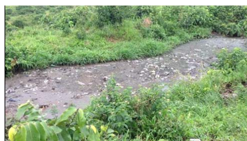
Fig. 3 (c) Trench for dewatering/separation of water from concentrated household sewage sludge