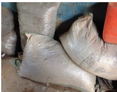
Fig. 3 (f) Dried and bagged household sewage sludge for future soil amendment purposes