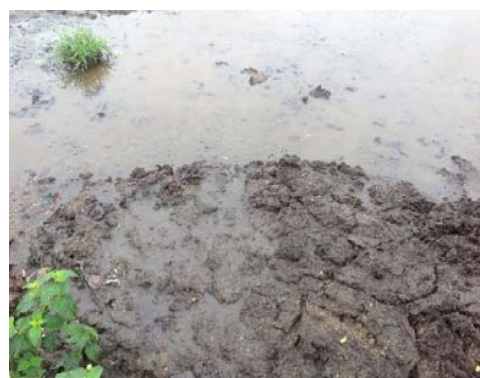
Fig. 2 (d) Household sewage sludge disposal point