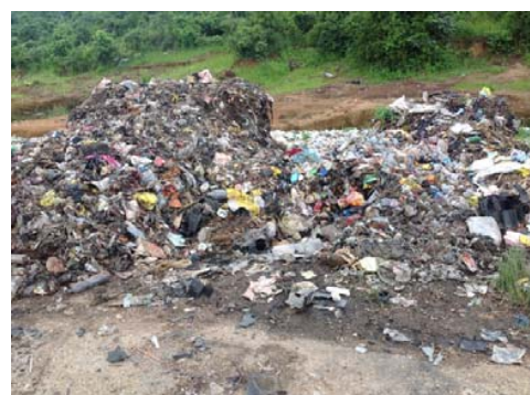
Fig. 2 (c) Urban refuse showing high level of heterogeneity