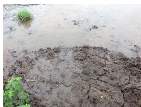
Fig. 3 (d) Concentrated household sewage sludge after dewatering