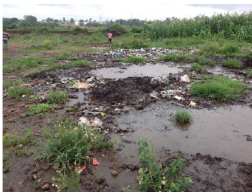
Fig. 4 Household sewage disposal point in close proximity to urban refuse disposal point