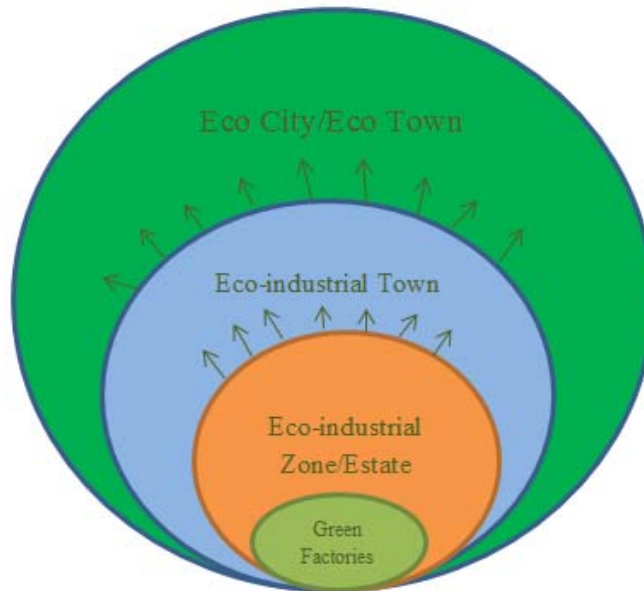
Fig. 1 The relationship between Eco-Town and Eco-Industrial Town

The concept of Eco-Industrial development has been applied to nine industrial parks in Thailand since 2009. The Eco-Industrial development reports show the uses of five development dimensions including 20 factors. The five development dimensions are physical, economic, environmental, social, and management dimensions. Detailed factors are shown in Fig. 2.