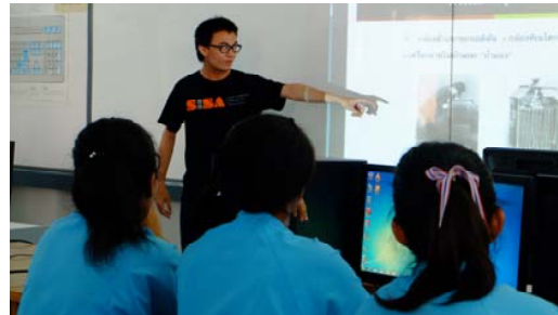
Fig. 5 Students from SISA share basic knowledge and skill in film production to the participant students before on-field activity