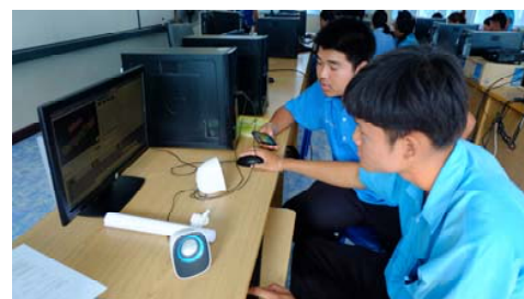
Fig. 7 Participant students learn how to edit video