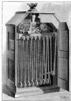
Fig. 1 Kinetograph