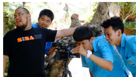
Fig. 6 Students from SISA participate in filming with all of participant students