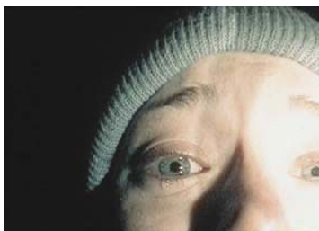
Fig. 2 ECU shot