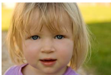
Fig. 3 CU shot