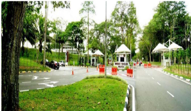
Fig. 2 Road connecting UTM and Taman Universiti

The vehicle route is sub divided into three types namely as main road, secondary road and service road. The main road in the campus is the road connecting UTM with Skudai Pontian Highway and Taman University. This road is the main access to the university campus.