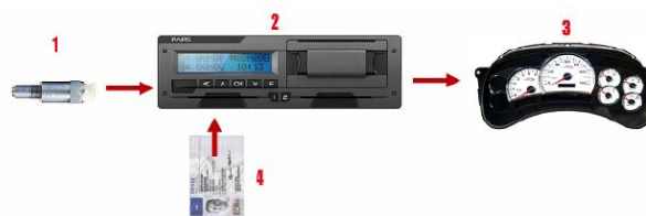
Fig. 1 Components of the tachograph system

The digital tachograph systems consists of the vehicle unit (VU) (usually referred to as the tachograph itself) (2), motion sensor (1), and smart cards (4) used in the system as shown in Fig. 1. The VU is also used to drive the vehicle cluster (3).