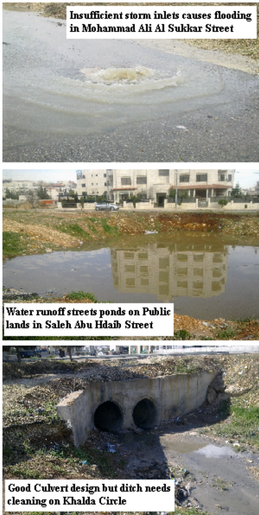
Fig. 4 Example Problems of the roadway drainage systems in Site 2