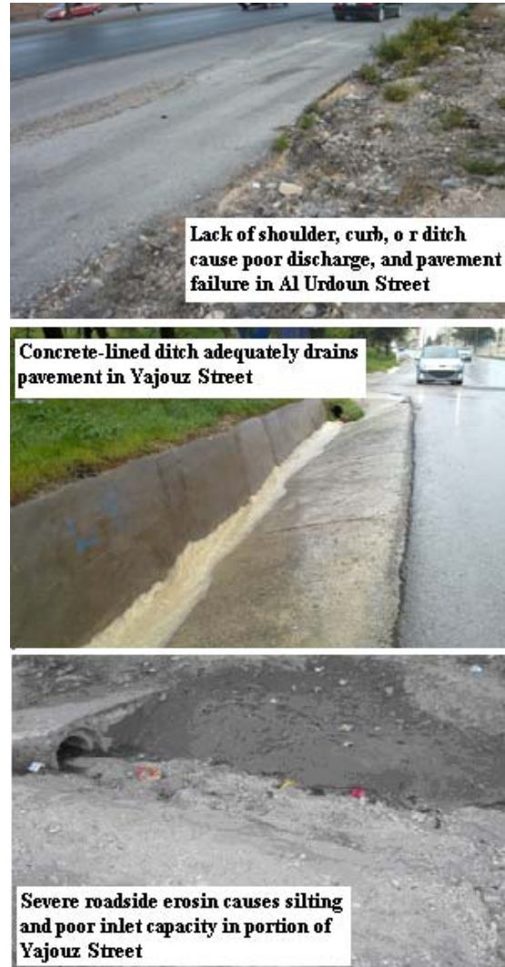
Fig. 5 Example Problems of the roadway drainage systems in Site 3

Although, the evaluation conducted in this study is simple and preliminary, it points out to the importance of conducting regular inspection of the existing drainage systems as an important part of maintaining and managing these roadways.