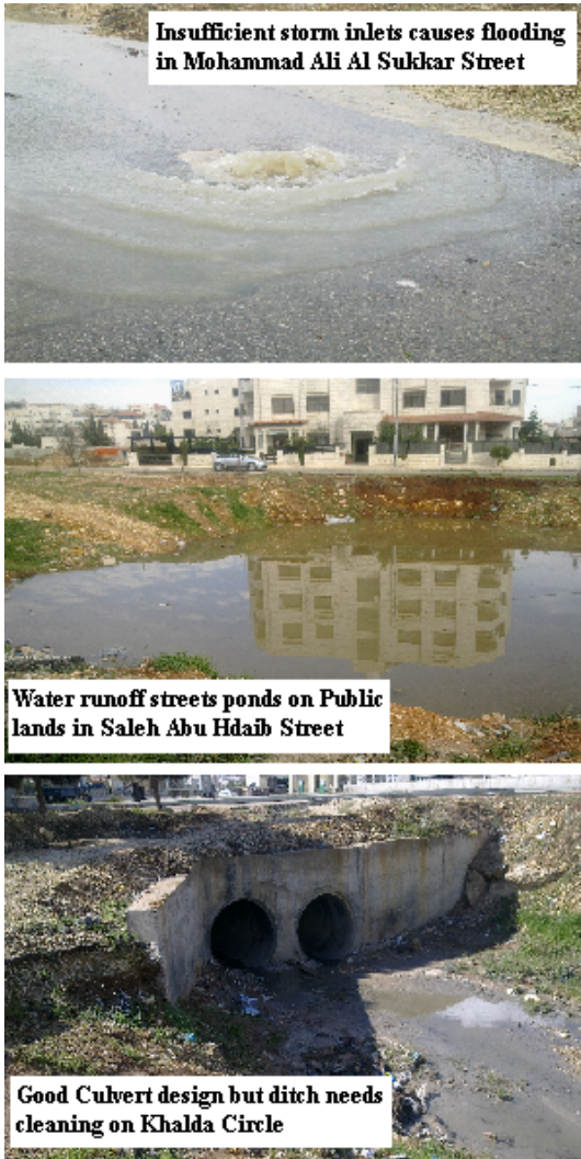
Fig. 4 Example Problems of the roadway drainage systems in Site 2