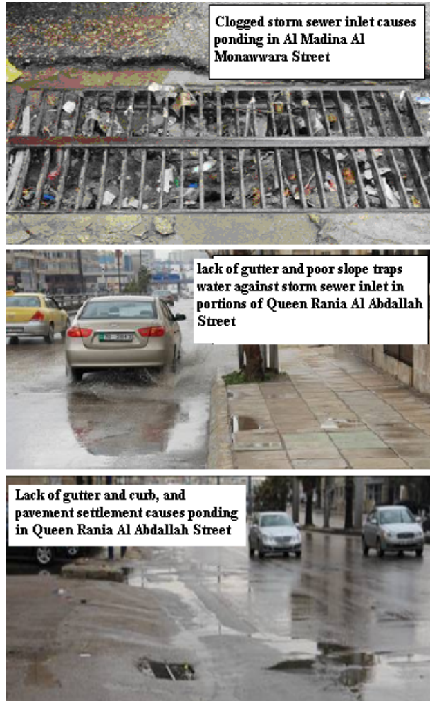
Fig. 3 (a) Example Problems of the roadway drainage systems in Site 1