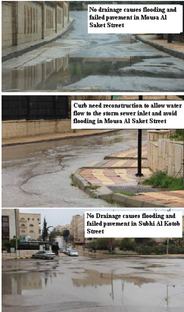
Fig. 3 (a) Example Problems of the roadway drainage systems in Site 1