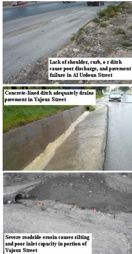
Fig. 5 Example Problems of the roadway drainage systems in Site 3

Although, the evaluation conducted in this study is simple and preliminary, it points out to the importance of conducting regular inspection of the existing drainage systems as an important part of maintaining and managing these roadways.