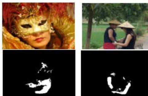
Fig 3. Skin detection for two images of the category "People".

We use images from the category "Society" composed of images with people. The algorithm uses 5 conditions applied on R,G,B (normalized) components [10].