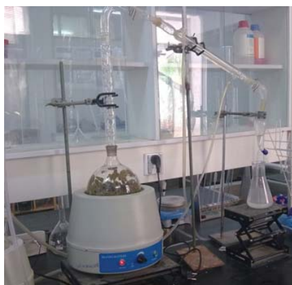
Fig. 1 Installation of hydrodistillation (Clevenger apparatus)

The hydrodistillation of Eucalyptus camaldulensis (leaves dry) is performed using a Clevenger-type device (1928) Fig. 1.