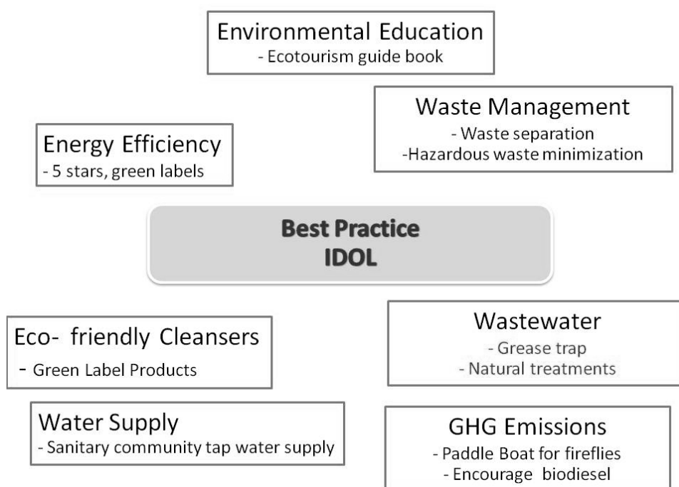
Fig. 3 Best Practice of Environmental Management for Tourist Accommodation.

Last but not least, environmental education in terms of develop ecotourism guide books are also essence to raise tourist’s environmental awareness.