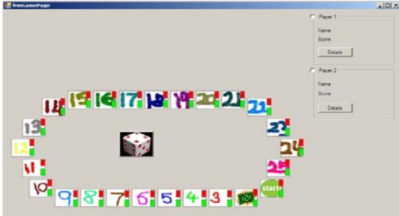
Fig. 1 Screenshot of the First Prototype

During the second visit, the game at that stage was not completed yet but contains major functionality of the game. The aim of it was to gather as much feedback as possible before completing the game to avoid unnecessary changes at the end of the development. Fig. 1 shows the screenshot of the initial prototype.