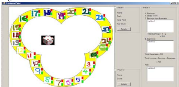
Fig.2 Screenshot of Second Prototype

Some of the feedbacks from Bistari Young Entrepreneur Sdn. Bhd regarding the current stage of the game are the dice inside the game does not resemble the real dice which have 12 sides, the layout of the level inside the game should resemble the real game because it is the symbol of the game, pictures are allowed to replace the wording inside the path layout, suggestion to include different level of difficulties of task as to accommodate different level of players, change the token that represent the players and too much pop up to display the task of the game. All of these feedbacks were considered and changes were made. Fig. 2 shows the screenshot of the changes that has been made.