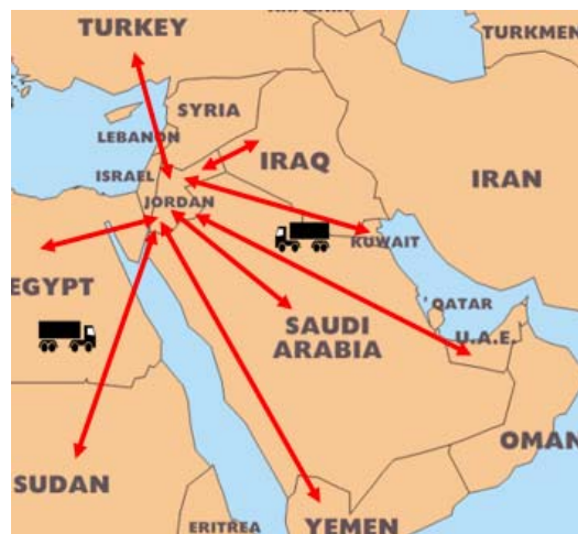
Fig. 1 (a) Regional and/or international TT from Jordan to different countries in two ways

the core principles related to transit in traffic that any transit country shall follow as non-discrimination and freedom of the transit. One of these international conventions is Revised Kyoto Convention (RKC) that adopted by the World Customs Organization (WCO) and provides technical details on how to apply and implement transit procedures, supplemented by a large portfolio of supporting tools including RKC Guidelines and Customs Transit Compendium [27]. [11] has taken into account some legal instruments and summarized general provisions that applicable to Customs transit as shown in Table I.