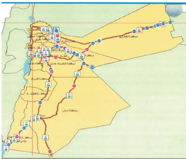
Fig. 3 Online monitoring of transit trucks [13]

Electronic tracking system for TT allows customs authorities' ability to monitor thousands of transit shipping trucks simultaneously on a real-time basis from a main central room that is equipped with many wall monitors as illustrated in Fig. 3. This system can prepare a report on a real-time basis in case any illegal events or actions occurred by the drivers. Also, this system can monitor the position and status of the transit trucks during moving on the predetermined fixed routes on real-time basis and based on predetermined time intervals or distances. All transit trucks will be allowed to travel separately with no needs for physical escorts on predetermined routes, electronic geo fences are established around these fixed routes and the areas that have a probability to be used for