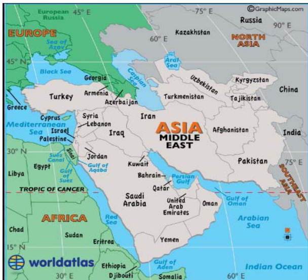
Fig. 2 The strategic location of Jordan (Middle East map) [19]

implemented since 2008 till present but covering just locally monitoring.