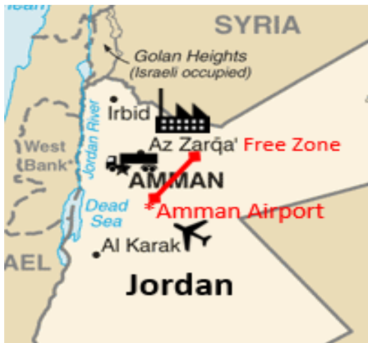
Fig. 1 (c) Transit at exportation, from AL-Zarqa free zone to Amman international airport