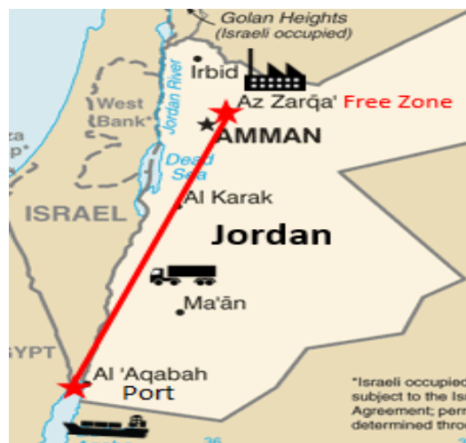
Fig. 1 (b) Transit at importation, from Aqapa seaport to inland Customs office