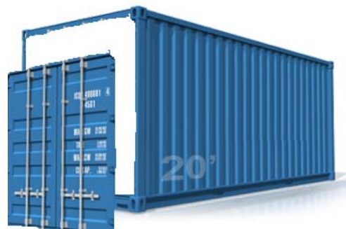
Fig. 8 Smuggling has happened in spite of the container doors were not opened with the existence of an electronic seal