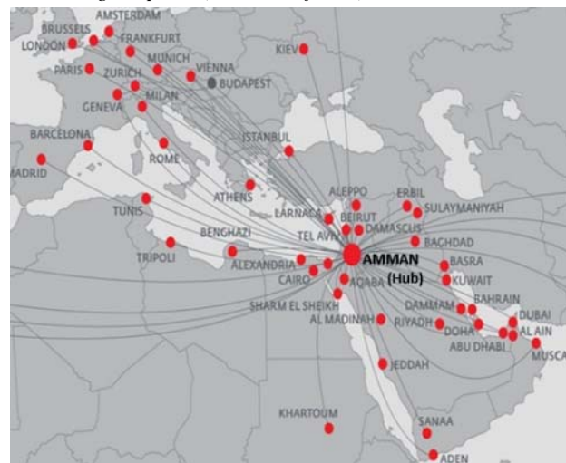
Fig. 6 Middle East Map (Jordan as a regional and international office for electronic TT monitoring) [19]

Due to the strategic location of Jordan in the Middle East, Jordan can be used as a regional and international office (hub) for monitoring TT; this can be done through preparing, establishing and expanding its infrastructure, initiating legal framework, coordinating and cooperating with other institutions, using and applying harmonized procedures, offering advanced reliable and dependable communication tools, using high advanced technology and other elements governing the movements of transit goods and traffic,