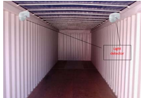
Fig. 7 Light detectors working wireless in parallel with an electronic tracking system should be fixed in internal the container

sends to the Jordan's regional and international control room (double-check security monitoring of an electronic transit tracking system), see Fig. 7. In some cases, smuggling was happened during the movement of transit truck from Aqaba seaport to Amman customhouse; the doors of the container were removed from its normal fixed points by cutting from the edges and still the doors were not open with existence of an electronic seal, despite that, the tracking system did not send any alarm to the main control room, see Fig. 8.