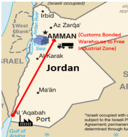
Fig. 1 (d) Internal transit, from one inland Customs office to another

According to RKC, there are two types of transit. The former is an international transit that applies to transit movements from an office of entry to an office of exit (through transit) as illustrated in Fig. 1 (a). It occurs when the movements are part of a single transit operation crossing through several different countries governed by regional or international transit systems [27]. The other is national transit, which applies to cases from an entry office to an inland Customs office (transit at importation); and from one inland Customs office to another (internal transit) in the same country as shown in Figs. 1 (b)-(d). Customs transit is a movement of cargo under Customs authorization and control, essentially followed by other Customs procedures such as import procedures for local market use in the cases of transit at importation; or exit procedures to leave the country as in the cases of transit at exportation or through transit [23].