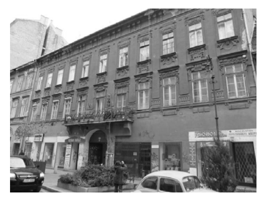
Fig. 3 A characteristic example for residential house type Nr 10.

dioxide emission for heating and domestic hot water is also decreased by 50% in case of cost-optimal and 60% in case of deep renovation [5].