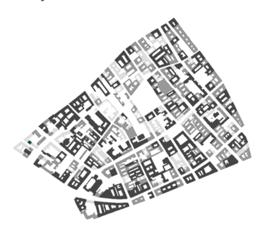
Fig. 7 Energy intensity map of the case study area. The darker buildings consume more eating energy

The energy intensity map (Fig. 7) was created by calculating each building's heating energy demand. For the calculation, the previously measured geometrical data were used. For simplification reasons, the buildings were divided into subgroups based on footprint and height data. To these subgroups, characteristic energy demand values were assigned. These characteristic energetic values were created statistically, by calculating various buildings' energy demand, chosen from each subgroup. The values were calculated by using the standard energy demand calculation of the European Union Energy Performance of Buildings Directive [Hungarian adaptation: 8].