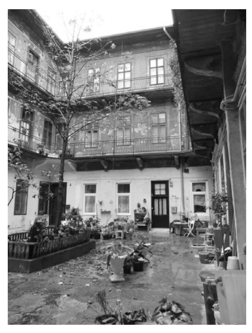
Fig. 2 An apartment house of the 1900's with enclosed courtyard

The first period ended with the World War I, around 1920. This is the era of the apartment buildings with enclosed courtyards (Fig. 2). During this period, the housing constructions reached their highest pace in Budapest's overall history. The two peaks were in the middle of the 1890s, and in 1913. The majority of the houses waiting for renovation were built in this era.