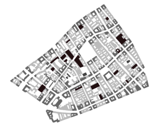
Fig. 6 Position of buildings. The lighter shaded buildings are "unbroken row types", the darker are "corner type". The black marked slots are empty