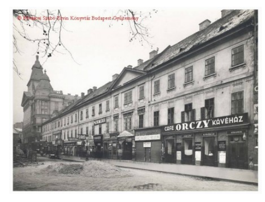
Fig. 4 Orczy House, one of the most significant tenement houses in the Old Jewish Quarter of Pest, already demolished [9]

The uniqueness of this so-called Old Jewish Quarter of Pest is that the early, 19<sup>th</sup> citizen houses of Pest can be found coherently and in exceptionally large number. On the other hand, since the Jewish commercial life flourished here, some rare apartment house type can also be observed, for example: passage houses, tenement houses built together with synagogues or small factories.