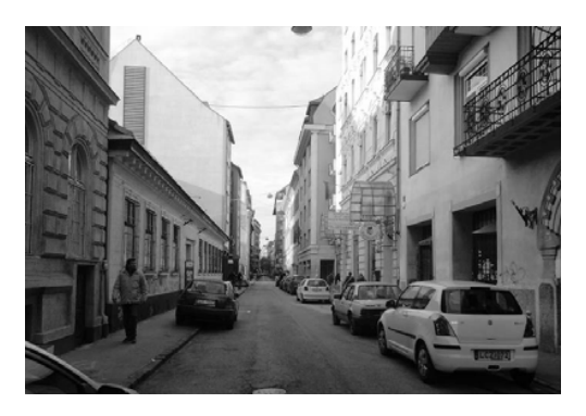
Fig. 1 Densely built-in urban fabric in Budapest; Photo is courtesy of Yuta Nagai Architect MSc

Reducing the UHI is especially complicated in case of historical inner areas, where the fabric, the landscape and the buildings are protected for their historical and architectural values (Fig. 1).