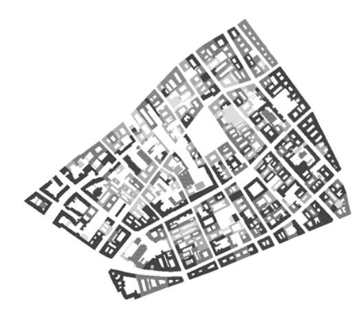
Fig. 5 Number of stories in case of each building: The higher the buildings are marked with darker shade, based on [3]

environment, while the "unbroken row type" buildings have a significant ratio of their enveloping surfaces connected to another building – decreasing the heat losses, which are higher if the surface is not covered.