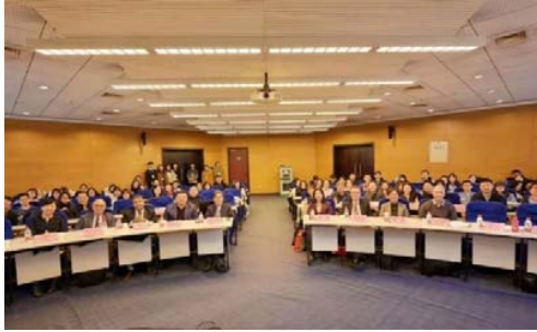
Fig. 7 Abundant international exchange activities of teachers and students in planning discipline