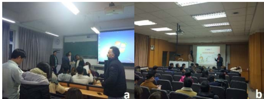
Fig. 2 Course Scenery of Research Methodology and Academic Writing