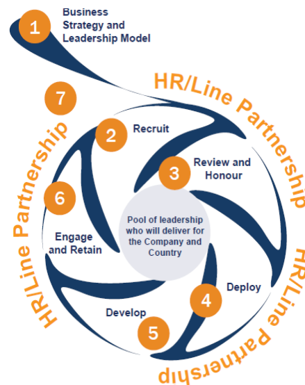
Fig. 2 Leadership Development Framework in The Orange Book: Strengthening Leadership Development

The scope of this research emphasized the seven leadership frameworks in The Orange Book: Strengthening Leadership Development prepared in the Malaysia Government-Linked Company (GLC) Transformation Program [9]. This orange book is prepared as a guide in establishing and managing leaders and other human capital. Its objective is to develop a guideline that contains best practices to attract individuals with high potentials. The effort to attract, develop and retain talented individuals is very critical in any organization. The framework is shown in Fig. 2: