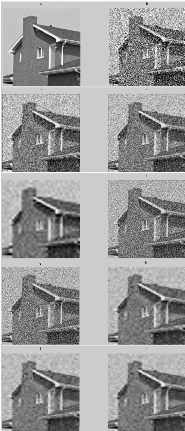
Fig 2,3 a) Original image. b) Gaussian noise with variance 0.06 is added to original image. c) Image denoising with median filter. d) Image denoising with wiener filter. e) Image denoising with global thresholding. f) Image denoising with stationary wavelet transform with hard threshold. g) Image denoising with stationary wavelet transform with soft threshold. h) Image denoising with Normal Shrink. i) Image denoising with Bayes Shrink. j) Image denoising with Modified Bayes Shrink (noisy pepper & noisy house)