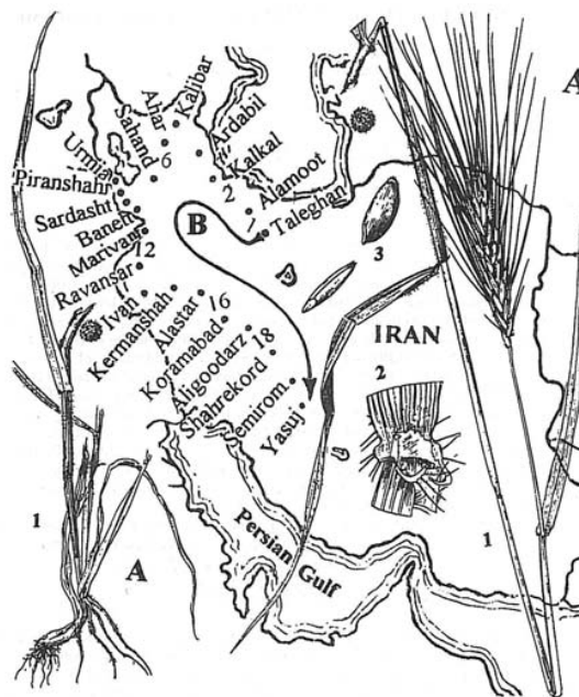
Fig. 1 The path and areas where the plant was studied in Iran

Through the paths from Taleghan (located on the Northwest of Iran; habitat N° 1) to Yasuj (located on the west of Iran; habitat N° 100) one hundred habitats (populations) of the T. boeoticum , selected and marked (Fig. 1). According to the climatograms, these habitats were ordinated from cold to very cold; always in boundaries between arid to humid areas [10].