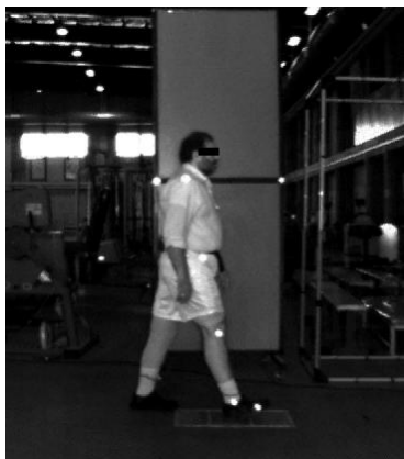
Fig. 1 The locations of markers used in the gait analysis experiment.

The hip and knee angles during the swing phase have been used from an experiment in which a transfemoral amputee was asked to walk along a walkway at his natural cadence. He was 45 years old, 165 cm high, with 85kg weight, and had more than 12 months experience in using a transfemoral prosthesis with Endolite esprit foot (Chas. A. Blatchford and Sons Ltd, Basingstoke, UK) and a Naptesco Hybrid knee (Naptesco Corp., Japan). Kinematic data of the lower limb during walking were measured by a motion analysis system (WINalyze 1.4, 3D, Mikromak GmbH, 1998, Germany). A high speed camera (Kodak Motion Corder, SR-1000, Dynamic Analysis System Pte Ltd, Singapore) was used to record the two-dimensional motion of the body segments taken at 125 \text{ frames s}^{-1} . As shown in Fig. 1, three reflective markers were attached to ankle (lateral malleolus), knee (lateral femoral epicondyle) and hip (greater trochanter). The subject velocity was almost 50 steps/min.