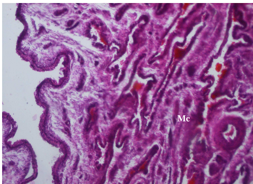
Fig. 1 Light microscopic structure of the vaginal structure in intact rabbits. Note to the extension of the muscular cells (Mc)