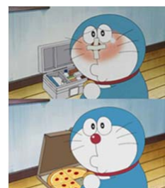
Fig. 4 Upper original version: Doraemon with a bandage on his face, and lower US version: pizza