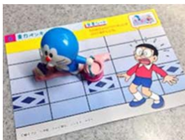
Fig. 3 Gravity painting

Doraemon also explains Einstein's theory of relativism [7]. When Nobita went to Suneo's house, he saw a science fiction movie about an astronaut who returned from the space travel for a year, but actually fifty years have passed. Nobita asks why the pilot spent only a year instead of fifty years. Suneo answered, "the closer the motion of an objects get to the speed of light, the slower the time passes. It is called relativism." In other words, time passes slower in the rocket. Then Shizuka explained relativism using Urashima's story. "It is like an old Japanese story about Urashima. When Taro returns from Ryuguiyō for three days, he returns home, but it actually passed three hundred years had passed. It is like a space travel. The one who helps Taro is a tortoise-like alien (in the story, tortoise), and with a tortoise rocket (a tortoise) takes Taro to a wonderful star, Ryuguiyō." "Eight days in Ryuguiyō" (Ryuguiyōno Hachinichikan) [8].