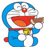
Fig. 2 Doremon eating his favorite sweet bean cake

Fujiko F. Fujio (Doraemon's creator, a penname of Fujimoto Hiroshi.) decided on different storylines for different ages of children in the six magazines, e.g., different interesting secret gadgets for 7 and 8 years old children, Nobita's spiritual development for 9 and 10 years old and environmental issues for 11 and 12 years old. Fujiko used the different themes which were appropriate to the ages and education levels of the children. He used many societal themes such as global warming, endangered species, homeless animals, pollution, and deforestation.