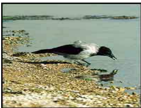
Figs. 5 and 6 Khark Wild life

One of the most active part of ecotourism industry is going to natural beautiful areas and watching closely different plants' and animals' species especially wild animals in their natural homes. These are attractions for a lot of tourists. Variety of plants' species in Khark and Kharko Islands are the same as south of Iran; therefore strong dry climate plants with deep roots grow there. Although; plants' species in these two islands are limited, but from the middle of November some small parts of the islands are covered in green; which is about \frac{1}{3} of the islands. This view can be seen mainly in north and west mountainsides and at the same time half of the north mountainside is covered by snow. Herds of gazelles and birds' garden are some examples of the wildlife in the islands; also the marine life on the seashores, floating algae and algae covering the rocks, rocks which are the place of living for different species of fish and mollusk, in these places birds, tortoises and lobsters lay eggs; all of the above mentioned are the ecotourism potentialities of these islands