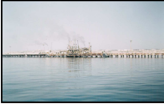
Fig. 9 A view of T dock