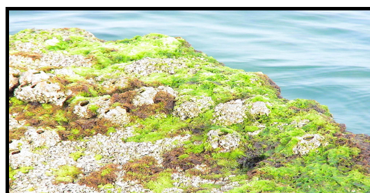
Fig. 4 Algae growing on rocks in Khark Island