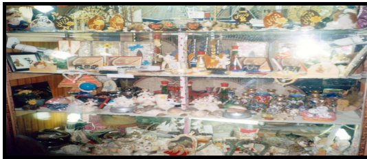
Fig. 12 Handi Craft