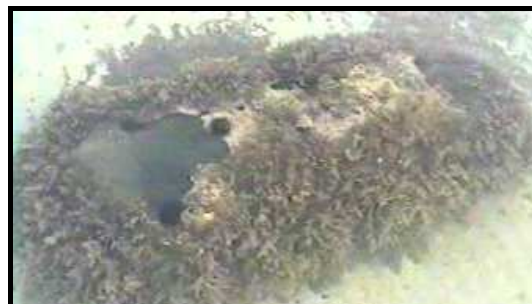
Fig. 7 Khark plants life