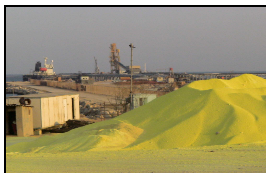
Fig. 8 Sulphurous hill in Khark coasts

Therefore; it is necessary to pay attention and emphasize on ecotourism; by considering environmental potentialities in cultural tourism and ecotourism not only the problems of the local people will be solved but also it prepares the situation to attract tourists from other provinces in Iran and abroad.