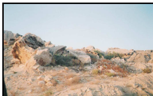
Fig. 2 mKhark Coral Reefs and Geology