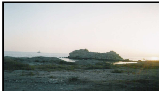
Fig. 1 Khark Coastal Reefs

calcareous stones is like a strip of sand and stones which have been made by sea erosion and weathering The low altitude seashore are in the south and part of the west and also in the northwest of the island and their altitude are about 5m to 500m. Almost all of the parts in the northeast and east seashores have got low altitude which is less than 5m.