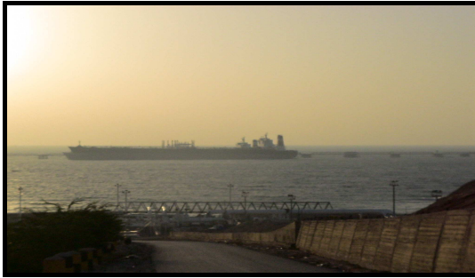
Fig. 10 Azar Dock