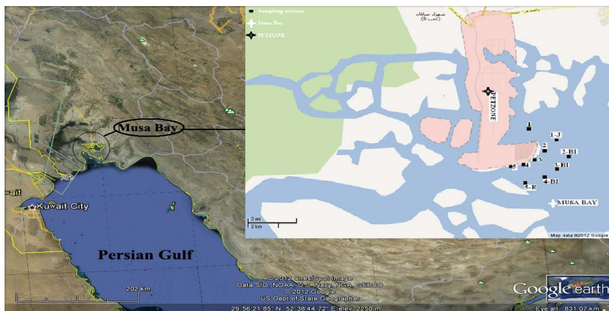
Fig. 1 Sampling stations in the Musa Bay

The PELq factor is the average of the ratios between the concentration of these parameters the sediment sample and the related PEL value [23, 24]. This factor describes contamination effect on biological organisms in sediment which range as non-adverse effect ( PELq < 0.1 ), slightly adverse effect ( 0.1 < PELq < 0.5 ), moderately adverse effect ( 0.5 < PELq < 1.5 ) and heavily adverse effect ( PELq > 1.5 ) [25].