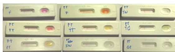
Fig. 3 Positive results

From 69 Drugstores in Phaya Thai District