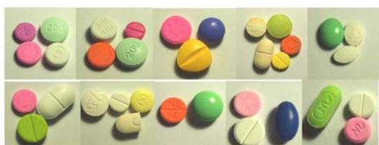
Fig. 1 Drug combinations collected from drugstores in the Phaya Thai district, Bangkok, Thailand

The drug combinations were brought and collected by students who study in Department of Aesthetic Health Science and Department of Applied Thai Traditional Medicine, Faculty of Science and Technology, Suan Suandha Rajabhat University. Price of each is 5-10 Baht and bought 5-10 sets at a time.