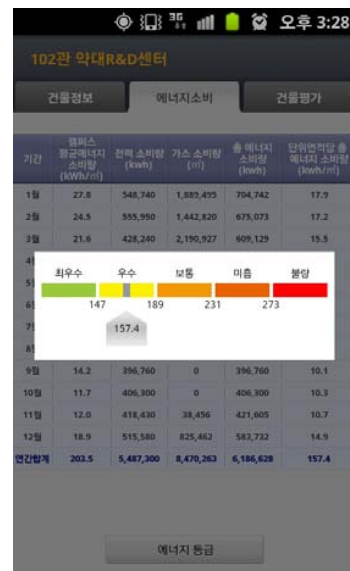
Fig. 6 Energy performance level by energy consumption