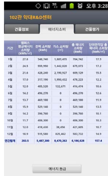
Fig. 5 Monthly energy consumption