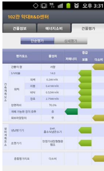
Fig. 7 Energy efficiency potential Assessment (Simplified mode)