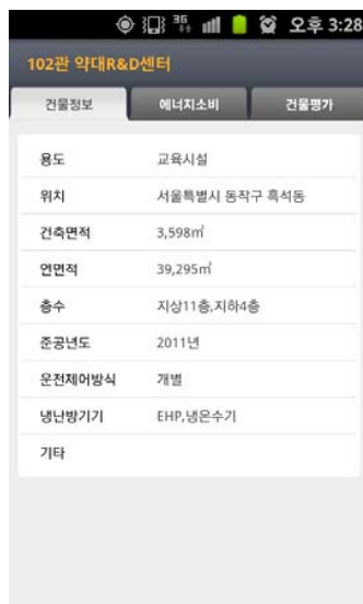
Fig. 4 Building information