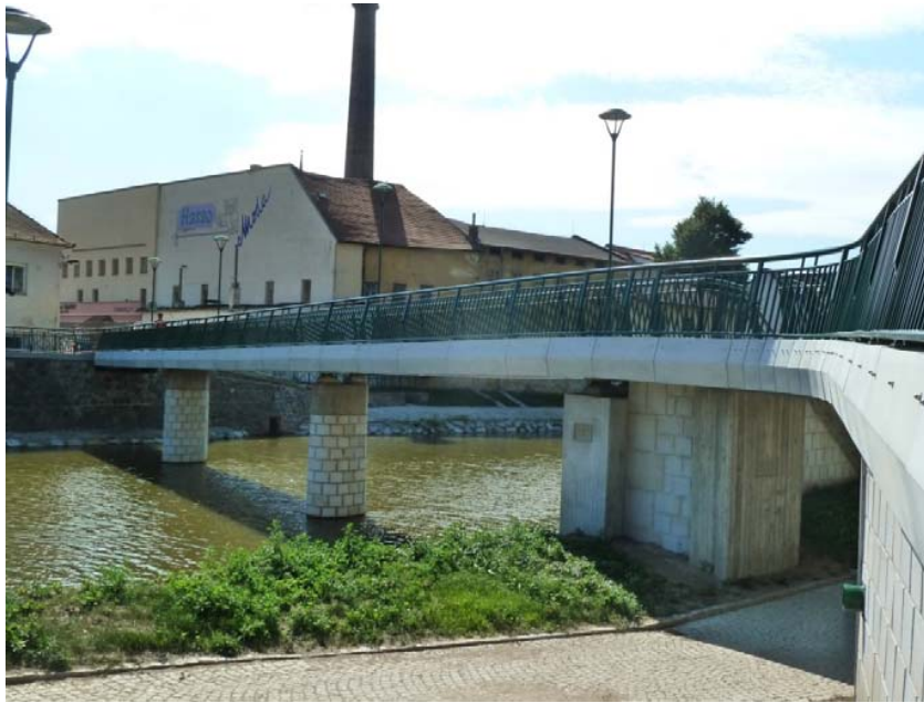
Fig. 4 Bridge cladding elements assembled at the foot bridge across a river