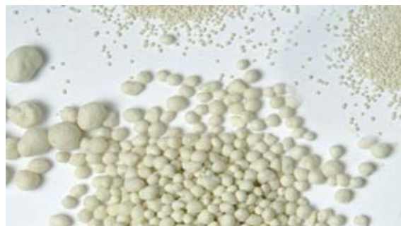
Fig. 2 Granulated expanded glass Poraver