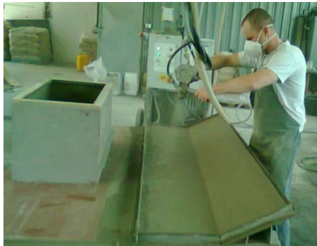
Fig. 3 Spraying of bridge cladding element

Tested elements were fixed in the same way as standard cladding elements to simulate real conditions. One part of each element was fixed to steel profiles, whereas the other part was not supported. The second part in real construction serves for covering of installation cables and pipelines. This part works as an overhanging end or rather a cantilever under uniform loading.