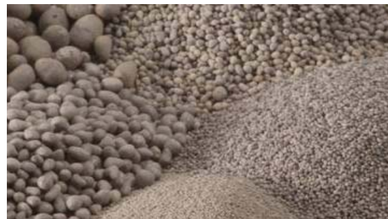
Fig. 1 Granulated expanded glass Liaver

For this evaluation a mixture consisting of 3 fractions of Liaver was used. The final fraction was counted as a weight ratio 33:33:33 of individual fractions 0.25-0.5, 0.5-1 and 1-2 mm.