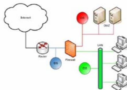
Fig. 1 Computer Network with Intrusion Detection System

Probe, User to Root (U2R) and Remote to User attacks (R2L). An IDS is a system used for detecting intrusions and reporting them accurately to the proper authority [1]. There are different taxonomies for IDSs which contain different categories. One of these categories classified IDS according to the source of audit data that will be used to detect possible intrusions which divided into two groups; Network intrusion detection (NID) and Host-based intrusion detection (HID) [2]. HID identifies the intruders by monitoring host-based traffic. While, NID refers to identify the intruders by monitoring network traffics (packets) and this can be accomplished by identify the attack by their known pattern (signature). Fig. 1 shows the computer network with IDSs [1].