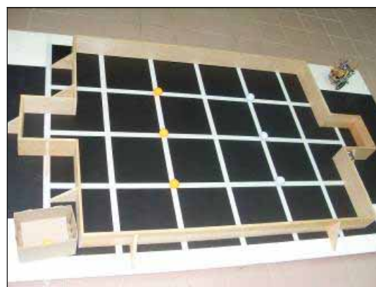
Fig. 1 Robot soccer competition field

The rules of the robot soccer competition are as below: