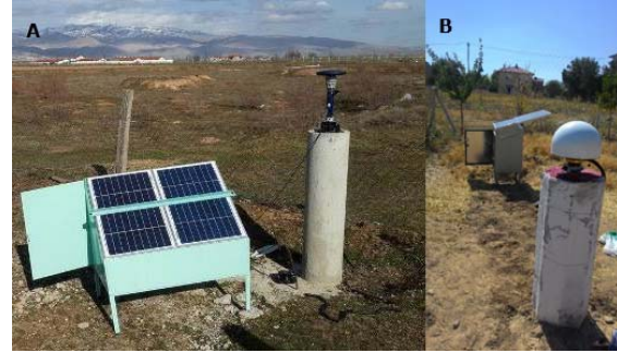
Fig. 4 The GNSS stations of AKTC (A) and BLV1 (B)

Other mathematical applications can be found in [1] and [14]. With the help of application written in the MATLAB environment, time series of height components of AKTC and BLV1 stations have been analysed and given in Fig. 5.