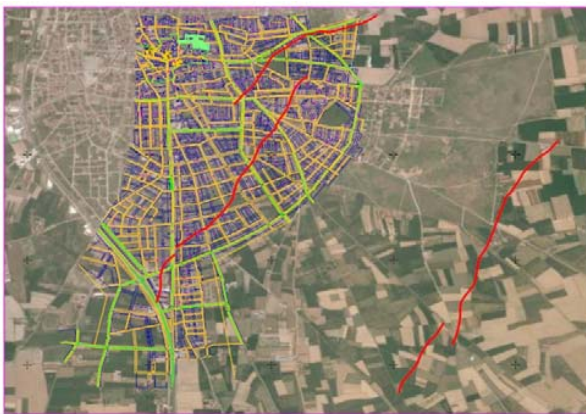
Fig. 2 The surface deformations which are parallel and semi-parallel to Bolvadin fault

Some of the buildings in the linear deformation zone, such as houses, schools, and medical centres, have deformed critically, and most have been evacuated. In addition, these deformations have also damaged the underground water, gas or the sewage network in the urban areas of Bolvadin (Fig. 3).