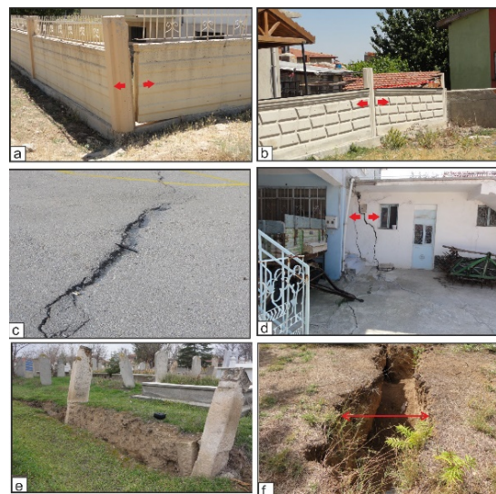
Fig. 3 The Surface deformations observed within the Bolvadin settlement area: (a),(b) The divergence of garden walls of some buildings located on the surface fault near the Park Akcan, (c) Linear deformations on asphalt pavement of the school garden, (d) Extensional cracks in some buildings located on the surface fault (e), (f) Deformations on graves

Some of the buildings in the linear deformation zone, such as houses, schools, and medical centres, have deformed critically, and most have been evacuated. In addition, these deformations have also damaged the underground water, gas or the sewage network in the urban areas of Bolvadin (Fig. 3).