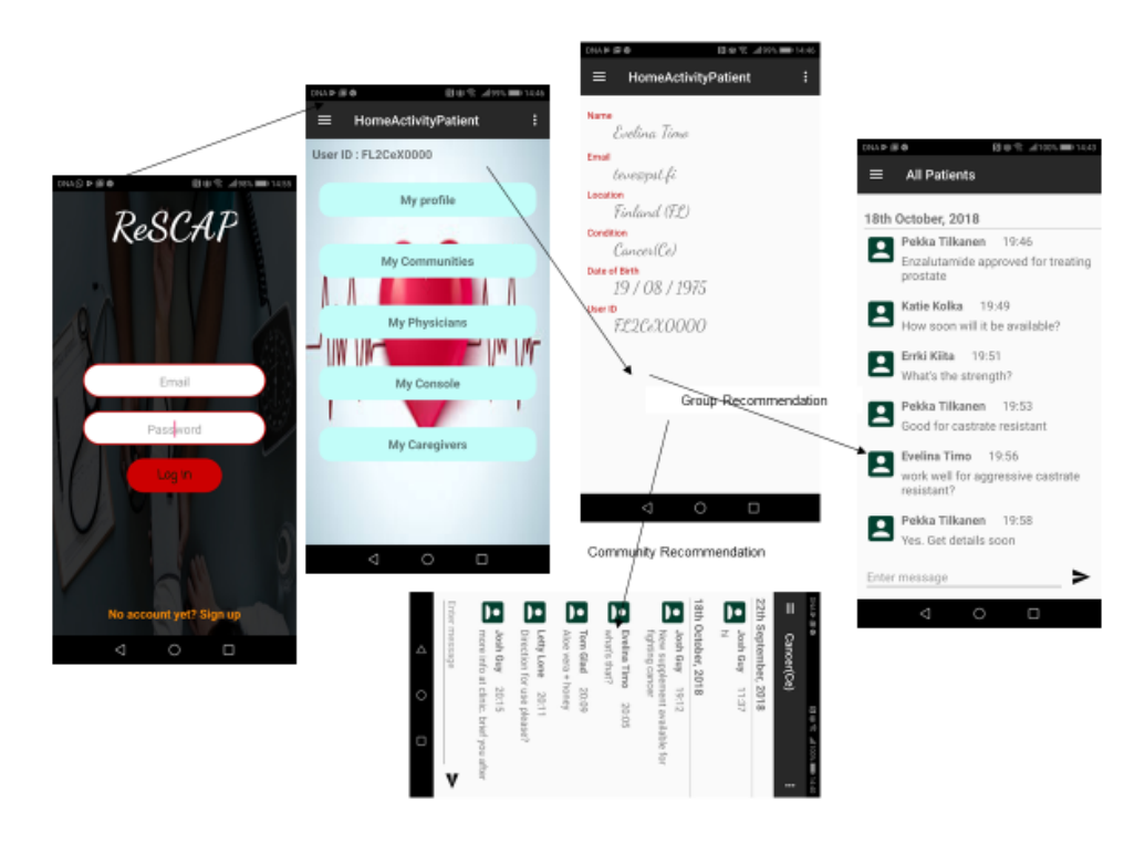
Fig. 2 Illustration of community interactions on recommendations sharing

The community component of the design addresses what happens between a care receiver and care providers. It also allows interaction and recommendation sharing among different players on the platform. These are the care receivers, physicians and care givers. Each of these has roles defined for them on the platform which also guides their access to care receiver's data. This community component has been implemented with the development of a prototype mobile app called ReSCAP. It provides a good platform for individuals with same illnesses to share treatment methods, drugs and dietary advice real-time regardless of geographical locations. It also allows real-time interactions among patients thus enhancing their cognition and social value. The physicians can be able to share research and treatment ideas among themselves based on consent obtained beforehand. Fig. 2 shows the recommendation sharing that can be possible between a physician and his patients and how recommendations can be shared among people in the community.