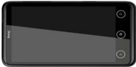
Fig. 2 Shows the solution to the problem. All buttons have a proper boundary defined and shows a circular region around every button