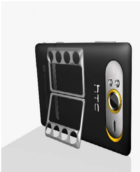
Fig. 5 Shows the use of flips as a mobile stand

The provided flips for grip not only provides a better handling but also to be used as a stand for making the mobile sit in front of the user. See the following image for better understanding.