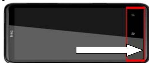
Fig. 1 The white arrow shows the area unintentionally touched by the users while scrolling the pictures

Use the mobile's picture browser to look through 15 different pictures. First perform a left to right scroll , mean see all the pictures by scrolling the screen in horizontal position from left to right. Once all pictures are viewed then scroll from right to left.