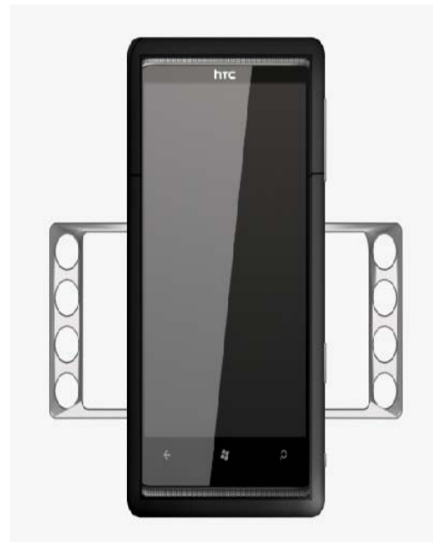
Fig 3 Shows a vertical position of mobile with flips on both sides for better grip on the mobile

The provided solution for this task was to remodel some of the extra features of the mobile. Though being slim is a good feature but at the same time its hard to handle a mobile. Following images shows the new remodelled flips for the mobile for better grip and handling.