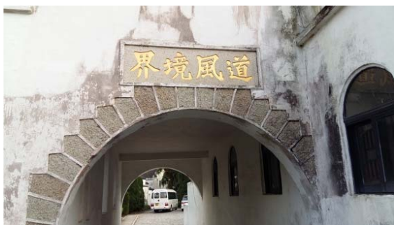
Fig. 3 Big-character calligraphy on one side of the archway to the architectural complex, Tao Fong Shan Christian Center.