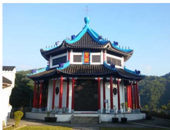
Fig. 6 Christ Temple, Tao Fong Shan Christian Center.

auspicious animals and mythological creatures, Christ Temple's roof ridge figurines (Fig. 8) represent pilgrims who come to the Christian Center to study and go out in all directions to spread the Gospel of Jesus [18, p.9].