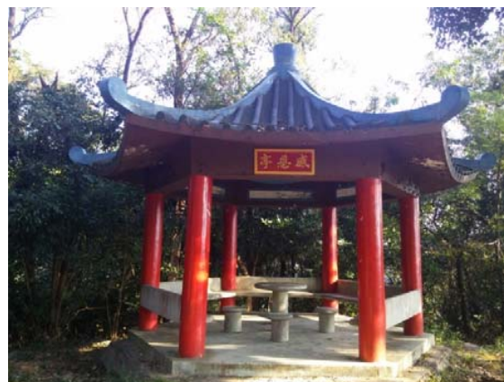
Fig. 20 Thanksgiving Pavilion.