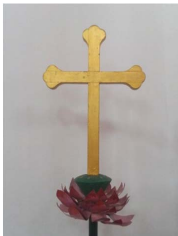
Fig. 12 A ritual wand in Christ Temple, Tao Fong Shan Christian Center.

Christian and Buddhist iconographies (Fig. 10). For instance, the bizarre union between the cross and the lotus can be seen on the altar table (Fig. 11) and a ritual wand (Fig. 12).