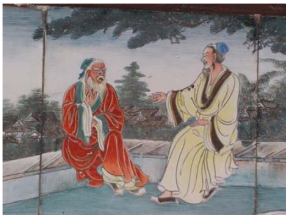
Fig. 22 Calligraphic expressions and the corresponding sections of tile paintings depicting biblical narratives with scenes of Jesus Christ dressed in traditional Chinese clothes.