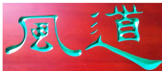
Fig. 2 Detail of the original Chinese designation of Tao Fong Shan Christian Center.

When entering the Christian Center, visitors will see works of calligraphy with elements of other Buddhist expressions carved on both sides of the archway to the architectural complex. Painted in gold, the two attention-grabbing works of big-character calligraphy contain the Buddhist expressions jingjie (Fig. 3) and daqian (Fig. 4). The former is often associated with the idea of different realms or stages of enlightenment whereas the latter can be interpreted as the vastness of the universe in Buddhist cosmology.