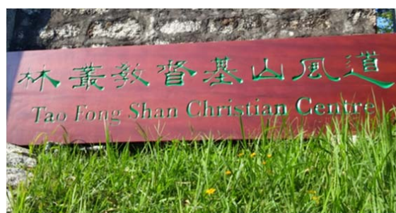
Fig. 1 Calligraphic expression of the original Chinese designation of Tao Fong Shan Christian Center.

Since works of calligraphy have been widely used to decorate Buddhist and Taoist monasteries, when seeing them non-Christian visitors might feel at home. Rendered in clerical script, this work is characterized by its squat-structured characters and the flaring horizontal and diagonal strokes. Despite the calligraphic composition's overall stability, the dramatic elongation of the horizontal and right-descending diagonal strokes offers a strong sense of movement and rhythm (Fig. 2). Moreover, the expressive effect of the brushwork is nuanced by the contrast of thick and thin at the beginnings, centers and ends of most strokes, thus furnishing an additional sense of buoyancy to the calligraphy (Fig. 2). In a sense, the overall brushwork's fluidity is flamboyant enough to be likened to the mobile nature of the visitors who are mostly Buddhist pilgrims and other spiritual seekers and wanderers participating in the Center's residency program.