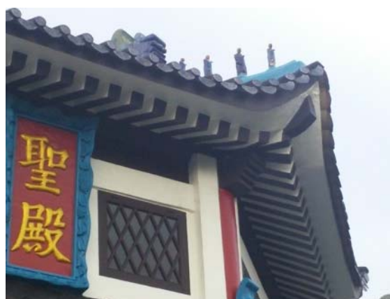
Fig. 8 Christ Temple's roof ridge figurines.

The calligraphic work with two big characters "sheng-dian"