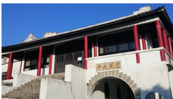
Fig. 4 Big-character calligraphy on the other side of the archway to the architectural complex, Tao Fong Shan Christian Center.