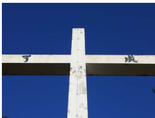
Fig. 24 The gigantic cross overlooking the Shatin valley with calligraphic inscription "it is finished,"