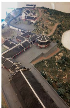
Fig. 5 Architectural model of Tao Fong Shan Christian Center, 1:200.

Coinciding with Karl Reichelt's vision to develop contextual Christian spirituality in Chinese arts and culture, Christ Temple (Fig. 6) was designed with traditional Chinese architectural elements. The octagonal structure with a double-eave pointed roof is reminiscent of the Hall of Prayer for Good Harvests leading to the Altar of Heaven in Beijing (Fig. 7).