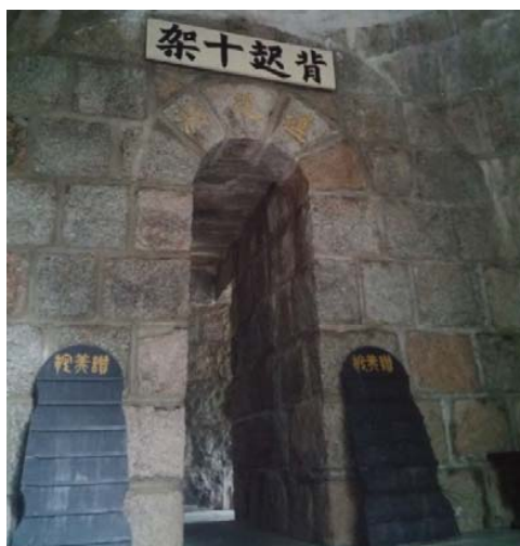
Fig. 18 Wooden plaque with the calligraphic inscription "Take up the cross" above the exit of Lotus Crypt.

suitable for expressing the idea of repentance followed by a renewed and upright life as opposed to the previous disorderly life. Chiseled in intaglio and painted in gold, the calligraphic work transforms into a striking sign that reflects natural sunlight from outside the entrance of Lotus Crypt. In a sense, the shimmering calligraphic brushstrokes that glitter outside the dark cell create a telling metaphor of victory over sin. Thoughtfully designed, the small cell accommodates only one person practising prayer on his/her knees. Echoing the spirit of repentance that can be expressed by a remorseful attitude and the humble body gesture of bending or kneeling, the design of the small cell reinforces the doctrine of repentance which is simultaneously and aptly expressed in terms of calligraphic style and synergistic elements of the gold color and natural sunlight. In a nutshell, the three calligraphic works housed in Lotus Crypt are perfect examples illustrating that there is strong interconnectivity in the chosen styles of calligraphy, religious doctrines and rituals, and architectural layout designs via effective overall arrangements of architectural and non-architectural elements to enhance visitors' religious or spiritual experiences.