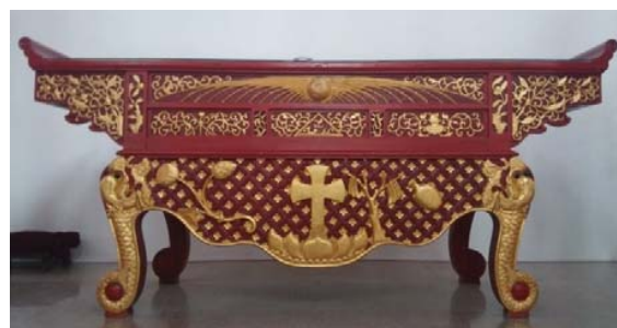
Fig. 11 Altar table in Christ Temple, Tao Fong Shan Christian Center.

In the Christ Temple, it is little wonder that the calligraphic expressions of the Chinese character tao as both a fundamental Christian doctrine and an Asian religious conception are ingeniously interwoven with a thoughtful integration of