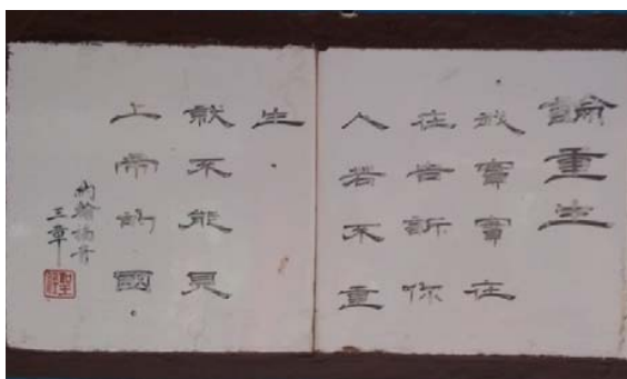
Fig. 23 Bible verses "Very truly I tell you, no one can see the kingdom of God unless they are born again". Clerical-script calligraphy as inscription of tile painting.