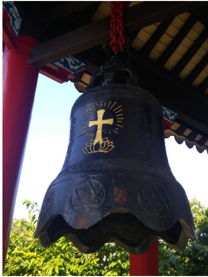
Fig. 16 Bronze bell decorated with the cross-lotus symbol.

by the upright-character composition in a broad-space arrangement, the monumental, powerful and dignified style is perfectly suited for expressing the literary content which describes major deeds of Jesus Christ's dignified life including his crucifixion as sacrifice for all mankind and his miraculous resurrection.