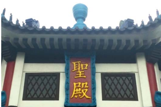
Fig. 9 The calligraphic work with two big characters "sheng-dian".

Functioning as the main space for worship, the interior of Christ Temple is adorned with major calligraphic works that reflect Reichelt's unique theology. The most eye-catching calligraphic works are placed right above the altar where major rituals are performed (Fig. 10). A golden plaque inscribed with the bible verse "The Word became flesh" (John 1:14) hangs over the centre bay, while the altar is flanked by a calligraphic couplet with two other bible verses "The Word was with God, (John 1:1) the wind blows wherever it pleases (John 3:8)." The three-fold nature of this calligraphic triptych (Fig. 10) creates a strong visual manifestation that points to the doctrine of trinity, with the "flesh" pointing to God the Son, and the "wind" a metaphor for God the Holy Spirit.