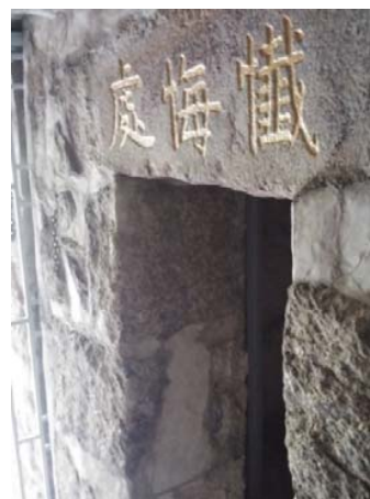
Fig. 19 Repentance place.

brushwork's airy and uplifting aura echoes with the lively lines in the human figures such as the drapery of the clothes (Fig. 22), breathing fresh life into the literary content of Jesus teaching on the doctrine of "born again".