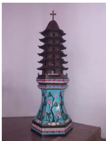
Fig. 13 Baptismal font in the form of a cross on a six-tiered pagoda.

Lotus is traditionally used as a symbol of purity and enlightenment in Buddhism. Hence the symbol of an integration of the lotus and the cross has been used as the official symbol of the Christian Mission to Buddhists, and it repeatedly appears in the Center's various published books, magazines and articles. Another Buddhist element can be seen in the baptismal font in the form of a cross on a six-tiered pagoda (Fig. 13). This purposeful combination of Chinese religious and cultural symbols with Christian doctrines and iconography vividly strengthens the calligraphic plaque's literary content "The Word became flesh", and consequently reinforces Reichelt's theology of Christ as the Eternal Logos for people from different religious background (Fig. 10). Meanwhile, the big golden cross on the wall at the far end of the aisle is obviously the most important focal point for worshipers