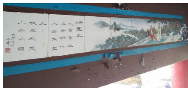
Fig. 21 Calligraphic expressions and the corresponding sections of tile paintings depicting biblical narratives.

Last but not least, to interpret Jesus's completion of his redemption of mankind, signified in his last words on the cross, "it is finished," the two characters cheng-le on the gigantic cross was rendered in Yan Zhenqing's (709-785) calligraphic style, tinged with an upright and steadfast spirit (Fig. 24).