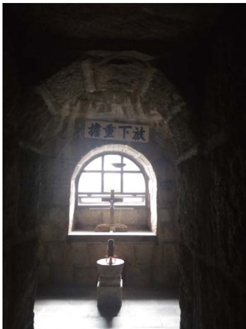
Fig. 17 Interior of Lotus Crypt with a wooden plaque inscribed with a calligraphic expression "Lay down your heavy burden".

Ringling the large bronze bell outside the Christ Temple is part of the elaborate religious ritual. The bell yields a