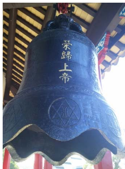
Fig. 15 Bronze bell decorated with a calligraphic inscription "Glory to God".

As a visually pleasing element, Chinese calligraphy is all-pervasive in religious rituals performed in the Christ Temple. This can be illustrated by a plaque on the wall that is inscribed with the lyric of Eulogy to God the Son [Fig. 14]. When singing this hymn together, worshipers are simultaneously inspired by the magnificent calligraphy by the Reverend Zhang Zhuling (1877-1961) whose personal style of calligraphy is reminiscent of that of the Tang calligrapher Yan Zhenqing. Characterized