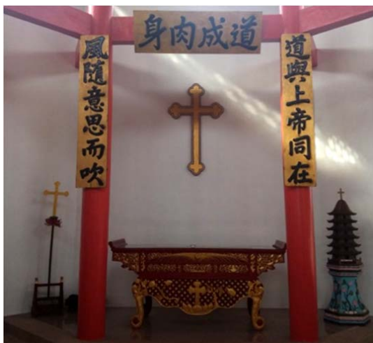
Fig. 10 Calligraphic triptych with three Bible verses.