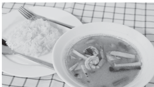
Fig. 4 Shooting angle at the top view of Thai light meal (Sour prawn soup or Tom Yum Kung)