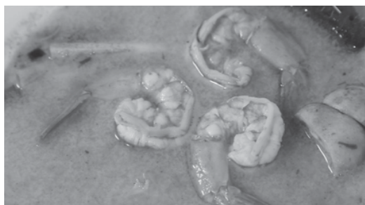
Fig. 5 A close-up image of Thai curry (Sour prawn soup or Tom Yum Kung)