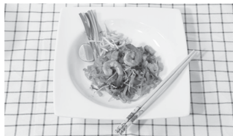
Fig. 6 Shooting angle at the top view of fried (Thai Fried Noodles or Phat Thai)