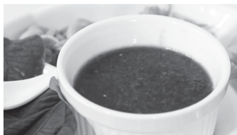
Fig. 3 A close up image focus on a profile on details of Thai light meal (Savory Leaf Wrap or Miang Kham)