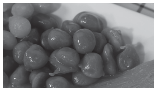
Fig. 9 A close-up image focus on a profile on details of Thai desserts (Thong yot, Met Khanon and foi thong)