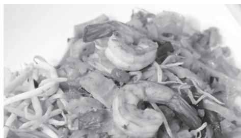
Fig. 7 A close up image focus on a profile on details of fried (Thai Fried Noodles or Phat Thai)