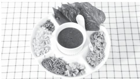
Fig. 2 Shooting angle at the top view of Thai light meal (Savory Leaf Wrap or Miang Kham)

From the result in part 1, the researcher can conclude the direction of designing and presenting media to present Thai foods to be a motion picture with the length of 3-minutes time.