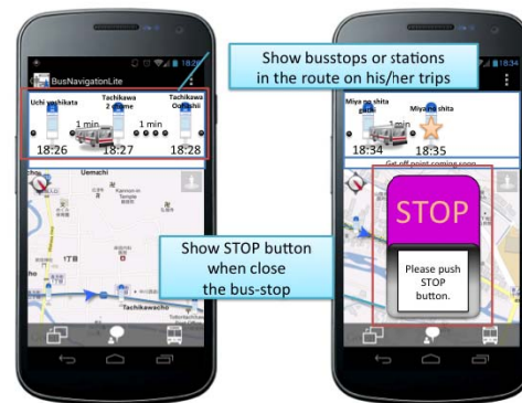
Fig. 7 Navigation on riding state

After the user ride a public transport, the navigation system goes to the riding state. On the state, the system shows a map and progress to the destination. When a passenger is arriving at the destination, the system alerts the user to get off. If he/she must transfer another transportation at that point, the system shows the way to move to the next point and information of the next transport. Figure 7 illustrates a user interface for the riding state.