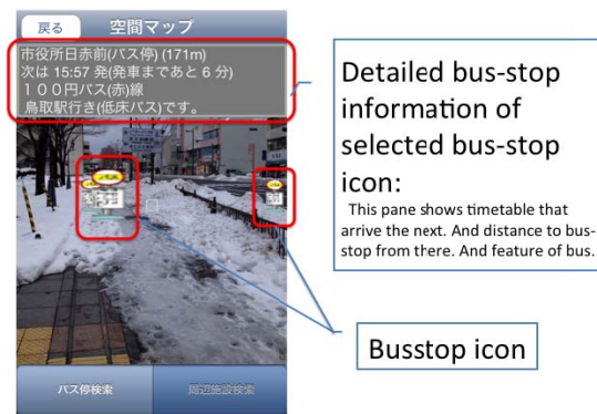
Fig. 4 AR navigation on "Bus-Net" system

The technology of augmented reality (AR) is being suited for real information. This technology can pile information on display showing real-time movie from camera. Therefore we developed to support bus users with AR technology [12]. This system provides information about bus-stops around user. And it provides information of buses coming close in the user. This system can reduce anxiety about buses. For example, it is anxiety about the bus late more then average when the bus comes. In addition, it is more instinctive to understand for showing information on real view. It is simple to use this system on smartphone. If user wants to know information, he/she has to hold the device only. Thus AR navigation is one of the ideal way at real-time navigation.