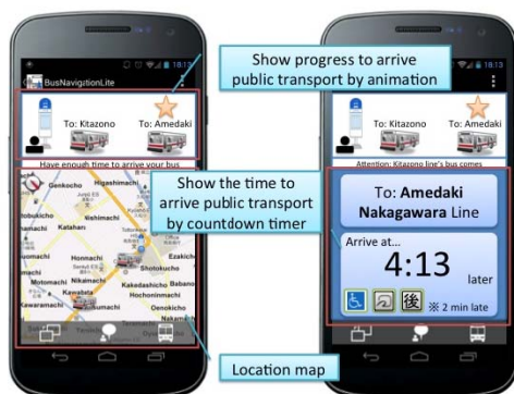
Fig. 6 Navigation on waiting state

On the waiting state at the bus stop or the station, a passenger is not just waiting with doing nothing. At first, if he/she takes a train, he/she must buy a ticket before riding the train. Secondly, he/she must go to the platform to ride a train. In addition, if he/she wants to drink something, he/she might go to the vending machine. Our system shows a map of the station, location of a vending machine or a store around the user, and countdown the departure time of the train. Figure 6 illustrates a user interface for the waiting state.