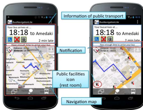
Fig. 5 Navigation on walking state

our system gives more specific information about public transport. Fig. 5 illustrates the user interface for the walking state.