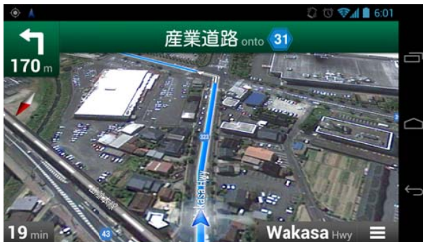
Fig. 3 Google Maps navigation

user goes another place without information of that area, he/she often uses navigation system. The system makes to guide a person who doesn't know information of that area. The system is used on driving with a high frequency. Therefore there are many functions on that system such several methods to input data. For example, a user could input to use map on touch display. Needless to say, he/she also could input destination name by text on virtual keyboard. And the important thing to remember is a driver cannot input data with his/her hand, and cannot look display so every time. For this reason, almost systems have voice input. It is assiduities for driver's safety.