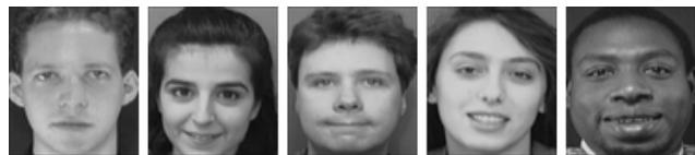
Fig. 1 Several face images from ORL Database

The experimental research of the qualifiers constructed on the basis of the described above indices of conjugation was made with the use of standard database ORL. The given base contains images of 40 persons. There are 10 various photos with different mime (for each person). Thus, the database contains 400 images. Fig. 1 shows samples of these images (one image per person).