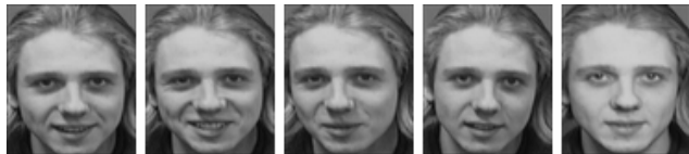
Fig. 2 Example of the images concerning one class

Matrixes \mathbf{X}_k were made of various sets of these vectors for each class. Number of vectors in matrixes was varied from 1 to 5 to reveal the dependence of recognition probability on the number of the elements in a class. Fig. 2 shows an example of five images of one person (class) on which one of 5600 \times 5 -matrixes \mathbf{X}_k was generated.