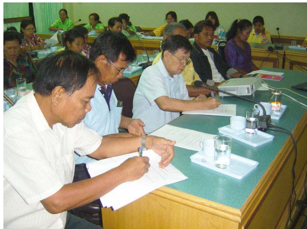
Fig. 1 Community leader training

with many problems and obstacles. In managing training, a distance to training locations and training course design irrelevant to the needs of participants become more problematic. Next in the line are insufficient numbers of facilitators and staff, and inadequate funding for training [10]. From these problems and obstacles associated with training, there occurs a developmental idea in a form of “distance training.” Long-distance communication appears as two-way communication which brings many parties to face-to-face encounters with natural sights and sounds. Thus, it facilitates all parties involved doing various kinds of their group activities [3]. However, essential modern instruments and installations of video conference for distance training high technology deployment consume high costs and high budgetary allocations, the researcher as a technology management expert would like to find appropriate ways and means to enable a suitable model for distance training possible and workable for community leaders in the upper northeastern region. This proposition will be pursued with the hope that it will solve the problems and consequently lead to the sustainable development of local communities in a not-far-distant future.