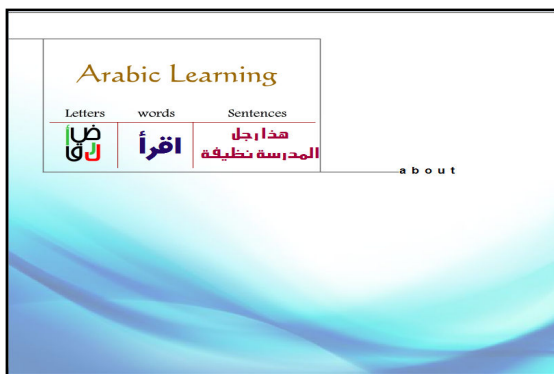
Fig. 4 System GUI

It can be simplified by using the interactive environments which would be closer to a wider understanding of the Arabic language, a main menu, Fig. 4, shows that learners can choose the topic that they are interested in and enter all materials which are included.